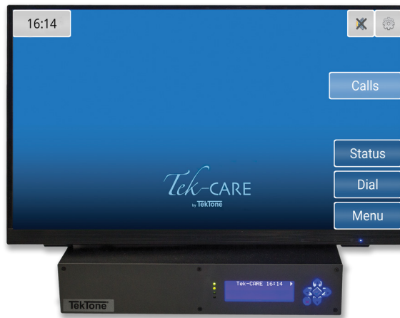
Tek-CARE Appliance Server (NC475DESK pictured)