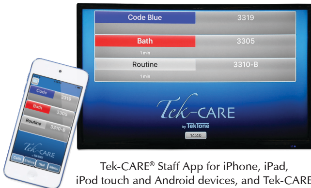
Tek-CARE® Staff App for iPhone, iPad, iPod touch and Android devices, and Tek-CARE App for Apple TV®