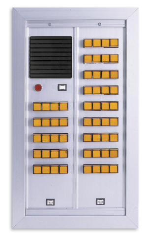
DS100/20 with AM100/36 and OF202

The DS100 System monitors doors, windows, or any device that uses open or closed contact switches, such as heat detectors, door/ window magnetic switches, and momentary emergency push buttons. Opening or closing any contact device causes an indicator light to latch ON and initiates an audible signal that may be silenced without canceling the visual signal. The visual signal may only be canceled at the master. Nursing Homes and Assisted Living Facilities use the DS100 to add door and window monitoring to a Tek-CARE® NC110, NC150 or NC200 nurse call system.