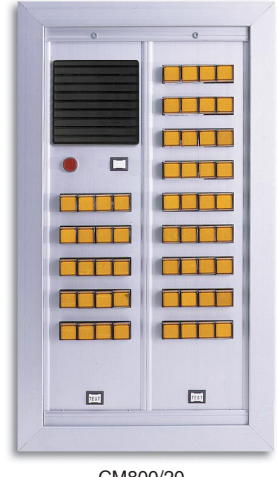
CM800/20 with AM800/36 and OF202

The CM800 System is used to visually and audibly annunciate mechanically latched dry contact switches for apartment buildings, schools, court rooms, etc. The annunciators may be used as remote extensions for other systems—or build a stand-alone emergency call system by adding SF117/SF118-series pull cord switches or SF154B push-button switches.