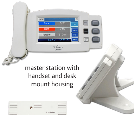
master station with handset and desk mount housing