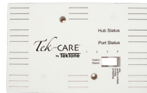
Tek-CARE hub (phase 2)