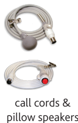
call cords & pillow speakers

(except for paging equipment, call cords, pillow speakers, the Tek-CARE Appliance Server, and refurbished equipment, which have a one-year warranty). See www.tektone.com/warranty.pdf for details.