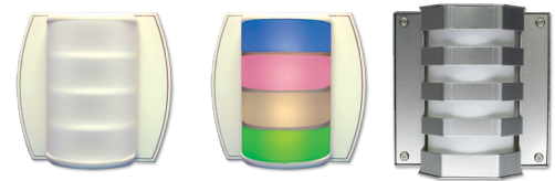
corridor light with 4 programmable-color LEDs, and optional vandal-resistant dome cover (plug-on zone light module also available)