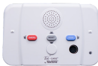
single/dual patient stations