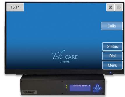
Tek-CARE® Appliance Server with Tek-CARE® Reporting Software