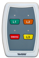
4-button staff peripheral station providing room-level presence, request, staff emergency, and room reset