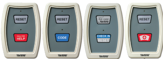
customizable 2-button pull-cord station shown in 4 water-resistant configurations: call for help, code blue, check in / reset, and nurse icon pull-cord