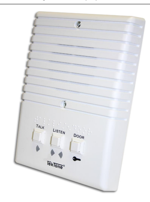
IR203E, IR204E, IR205E

Housings: IH103 mounting plate or IH101 box