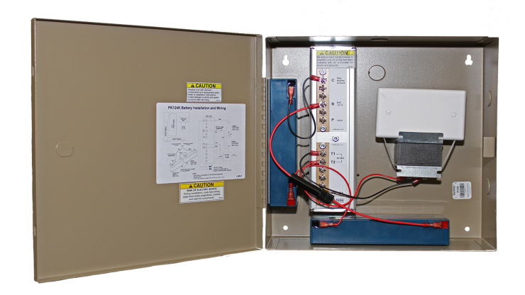
PK124K Battery Backup Kit

Mier BW3000 Offset Cam Lock, or equivalent