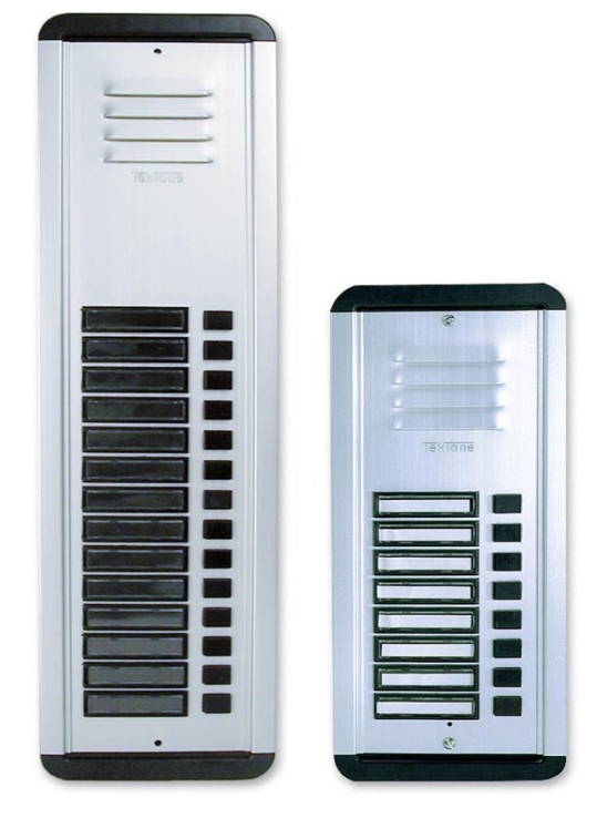
AM642-series Vandal Resistant Entrance Panel