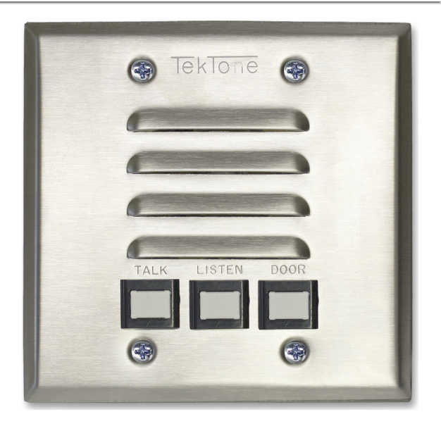
IR207B 4-Wire Apartment Station