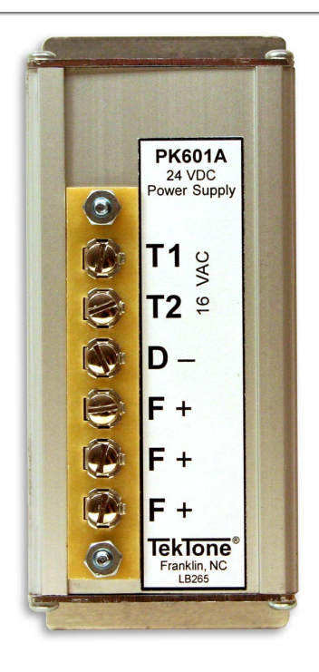
PK601A 24 VDC Power Supply