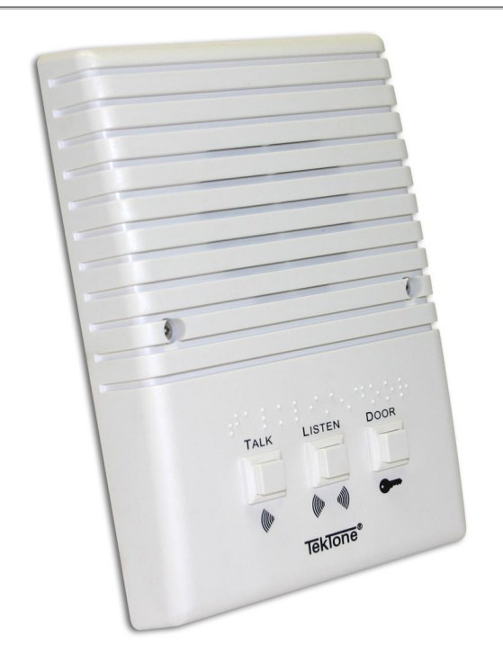
IR103E, IR104E, IR105E

Housings: IH103 mounting plate or IH101 box