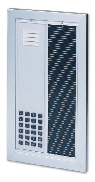
CM492/024 OF192 Frame and AM190D Directory

CM491-series and CM492-series Vandal Resistant Apartment Entry Panel