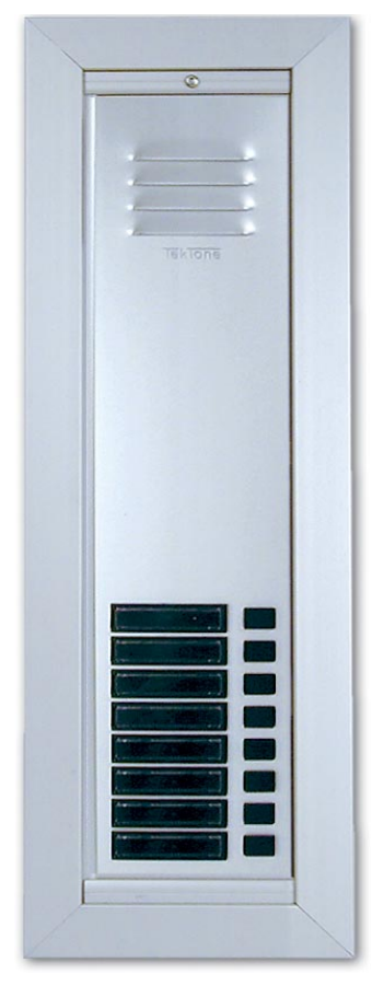
AM492-series Entrance Panel with OF191 Frame