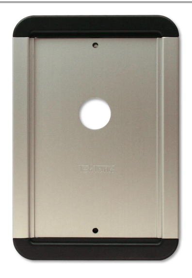
PO101S Postal Door Release