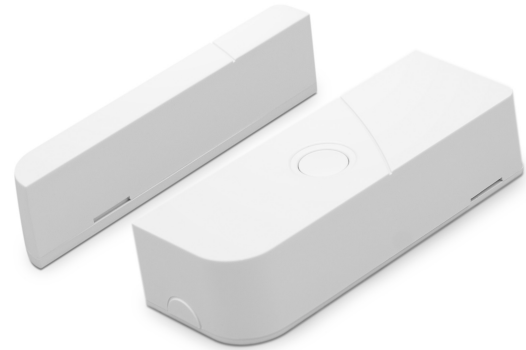
SF571 Universal Transmitter