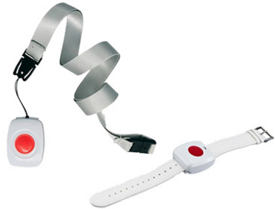
SF570 Pendant Transmitter SF570 with Wristband Option