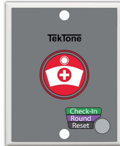
SF572 Pull-Cord Station