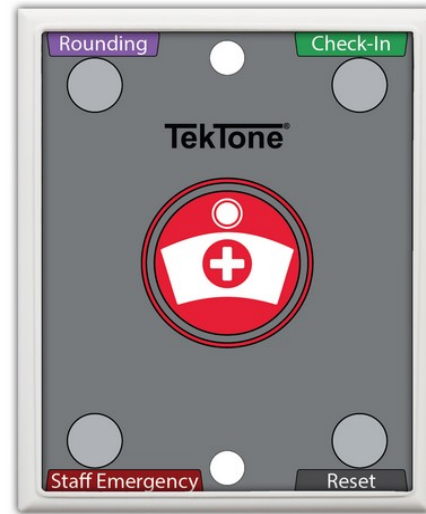
SF573 Single Bed Multifunction Station