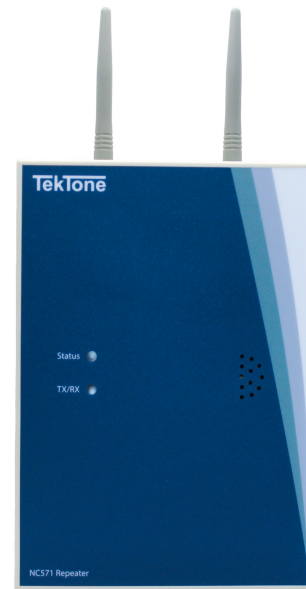
NC571 Repeater Unit