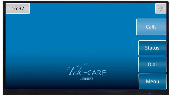
NC403TS Tek-CARE Monitor

The NC403TS Tek-CARE Monitor can be zoned to display calls from desired zones to improve staff awareness and efficiency. Up to 254 NC403TS Tek-CARE Monitors can be installed on a single Tek-CARE system.