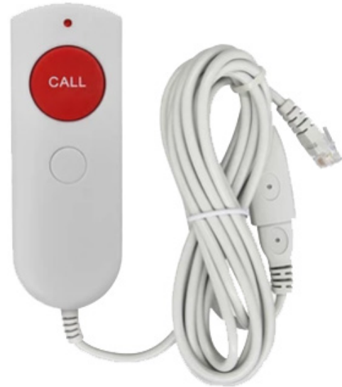
SF574 Call Cord