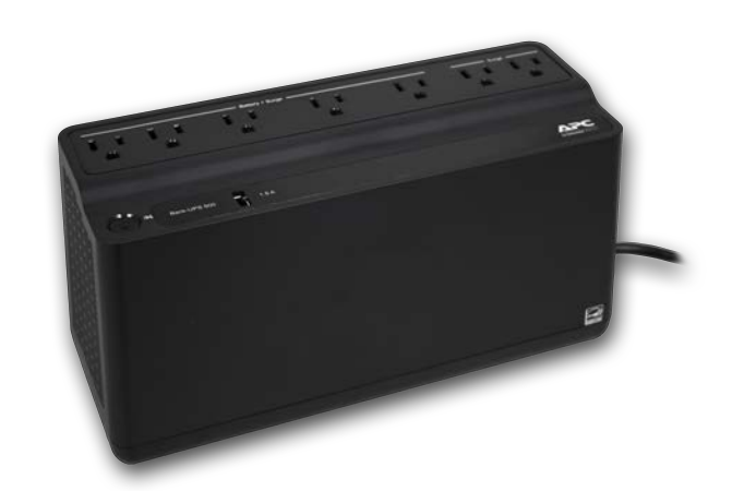
PK250B Uninterruptible Power Supply (UPS)

Connection: 5' cord with right angle plug