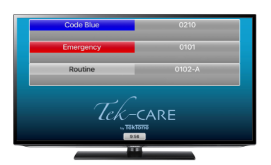
LS622-series Tek-CARE App for TV

Up to 255 Apple TVs with the LS622/x license can be installed on a single system.