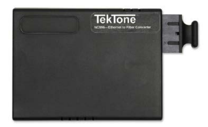
NC556 Ethernet to Fiber Converter

UL® 1069 Listed and cUL® Listed to CSA C22.2 No. 205; UL® File Number E71599. Evaluated to UL60950-1 Standard.