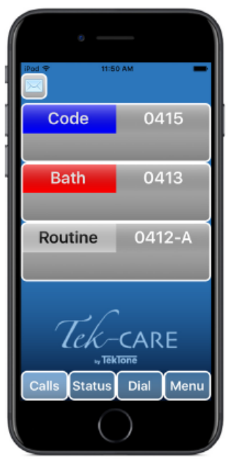
LS621/LS631 Tek-CARE Staff App

Up to 255 Tek-CARE Staff Apps can be used concurrently on a single system.