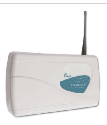
NC365B Paging Transmitter