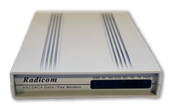
NC503 Central Monitoring Modem