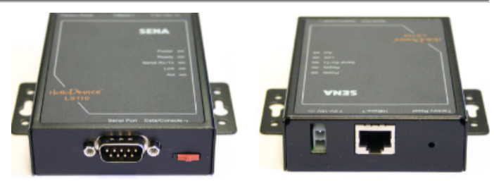
CT601 Serial to IP Converter