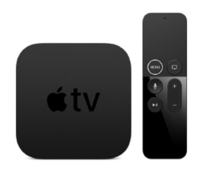
4th Generation Apple TV