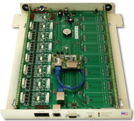
NC377-series Voltage Interface (exterior & interior)